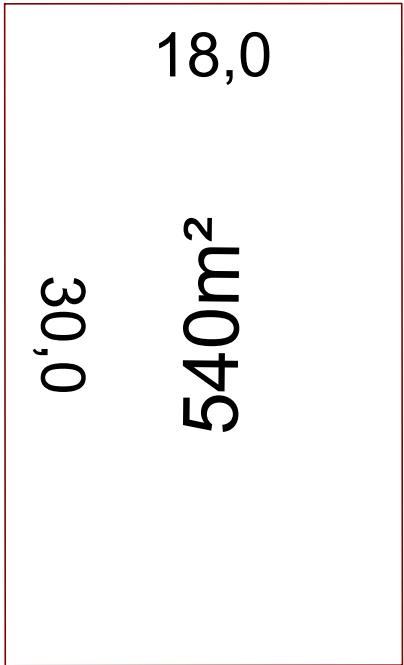
"Standard" erven >450m 2