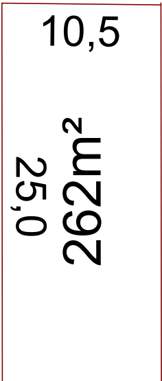
"Small" erven 160-300m 2